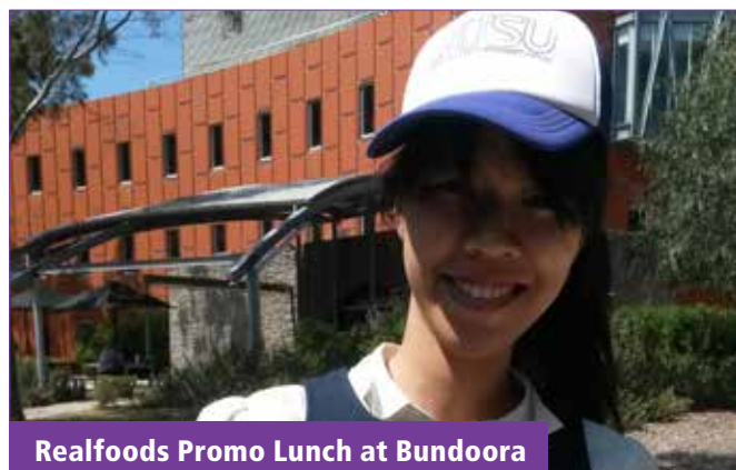
Realfoods Promo Lunch at Bundoora

The Postgraduate department spent the remainder of the quarter planning a broad range of events for 2016, including Speed Friending, a cocktail party, newly designed workshops and other freebies and activities for Postgraduate students.