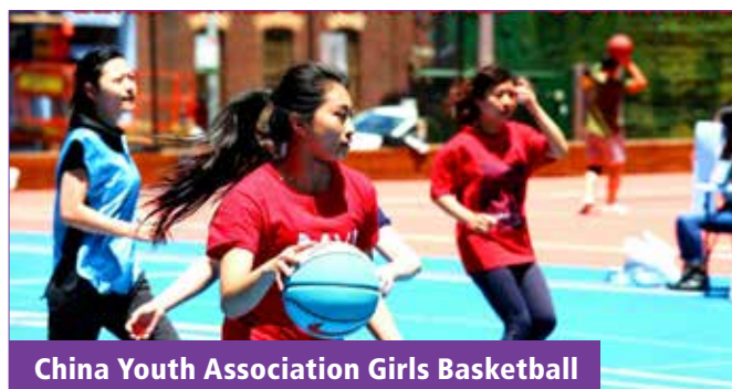
China Youth Association Girls Basketball