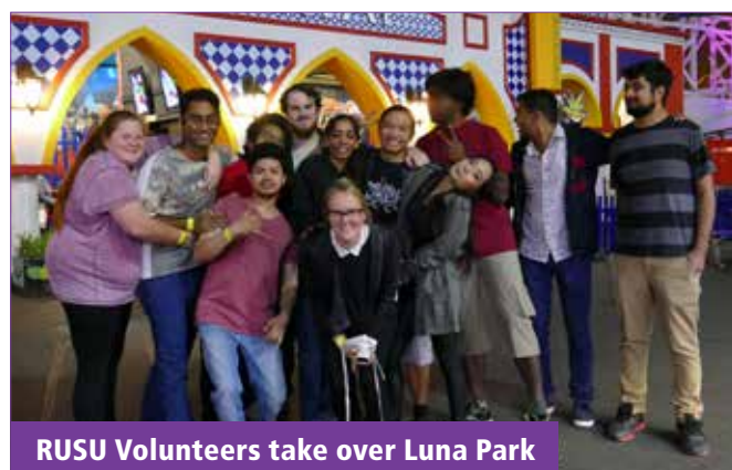
RUSU Volunteers take over Luna Park