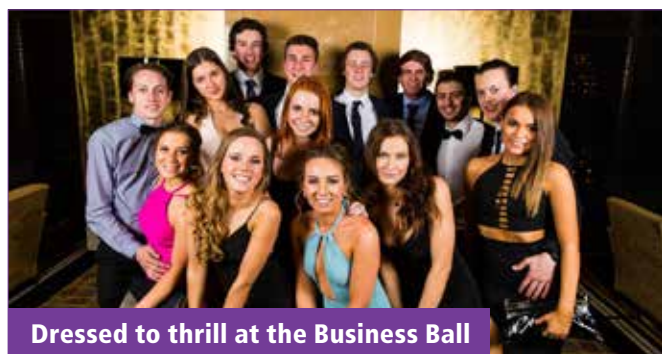
Dressed to thrill at the Business Ball