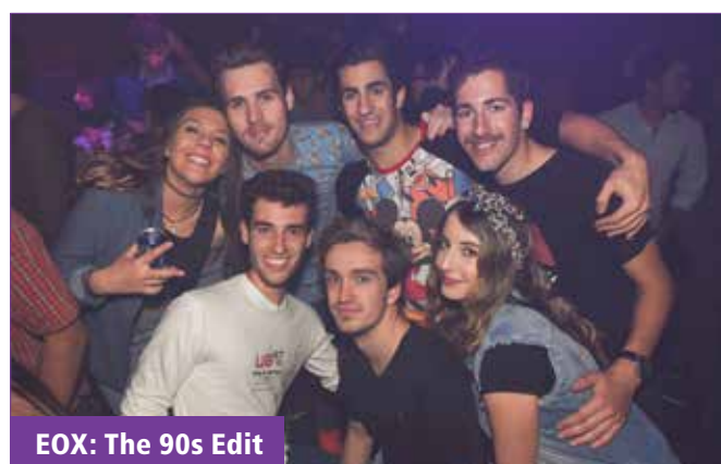
EOX: The 90s Edit

The final tally for 2015 was 5301 financial members. RUSU has set itself a goal of 7,500 financial members for 2016.