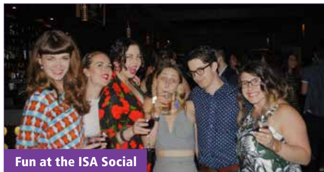
Fun at the ISA Social